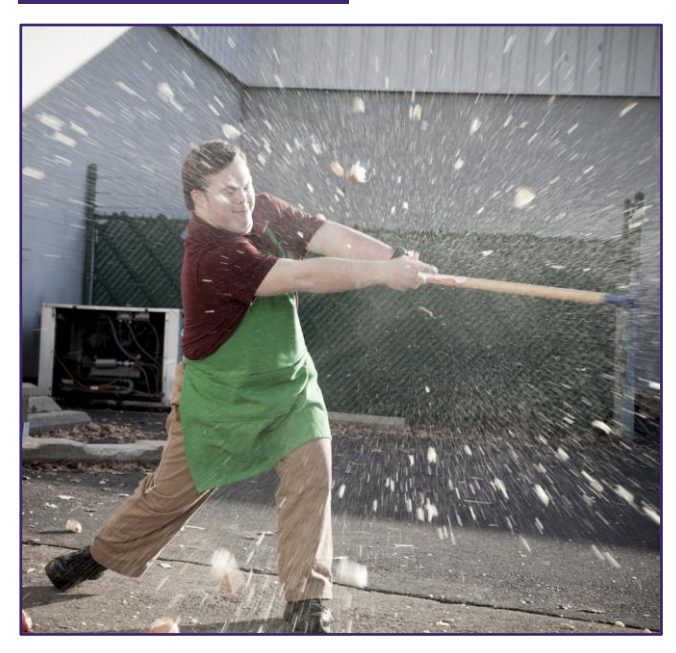
(Produce hitting it out of the park!)