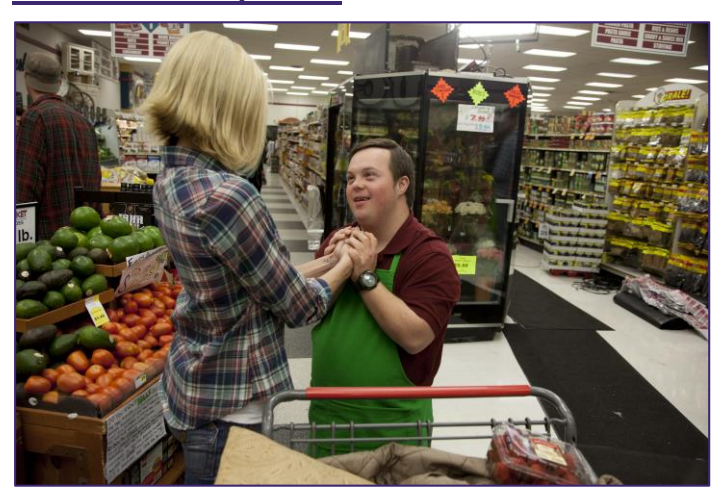
(Produce and Amy in the grocery store)